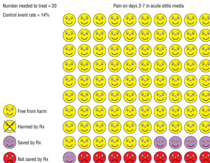
Fig 2 Portrayal of risks and benefits of treatment with antibiotics for otitis media designed with Visual Rx, a program that calculates numbers needed to treat from the pooled results of a meta-analysis and produce a graphical display of the result

The developments in how information is presented offer opportunities to put substance into commonplace healthcare discussions. But does this swing the balance away from the art of medicine? Will it become less of a "high touch" discipline, in which professionals try to support patients through episodes of illness, and more of a "high tech" one, in which reductionist approaches see pathways of illness as a series of dilem-